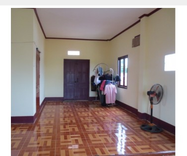
House for Sale