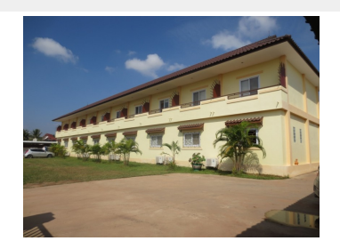
Apartment for Rent Per month